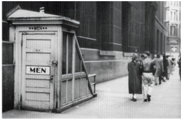
The first Rotary service project was the installation of public toilets in the city of Chicago.