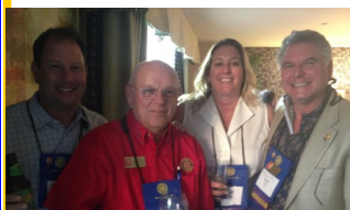
Rotarians at Recess